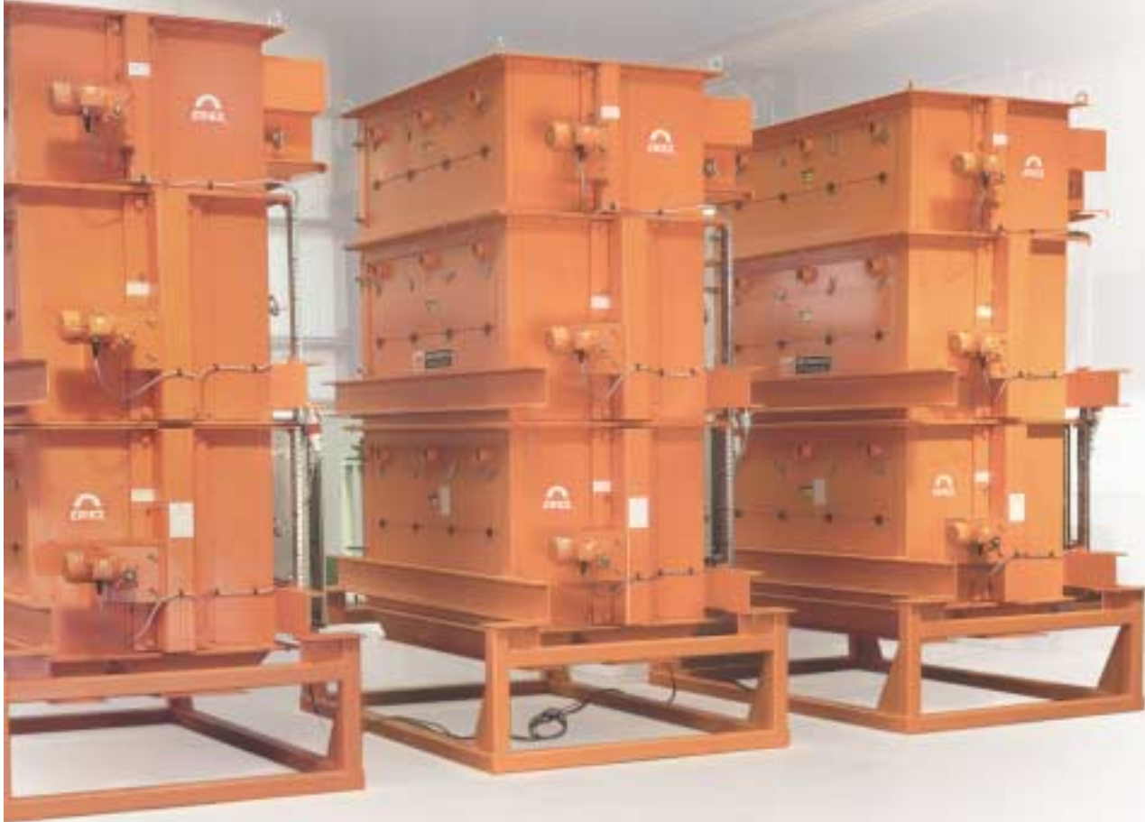
3 off Model FR-100-60-1 / RE-300-60-2

High Intensity, high gradient, permanent magnetic separators for optimum separation of paramagnetic particles from dry products.