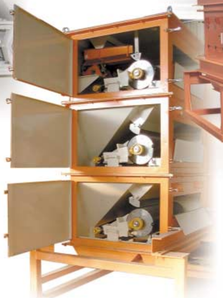
Right: 3 Pass RE-300-40-3