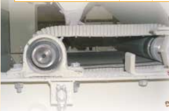
Above: RE-100 Roll recycling plastics

Note: Dimensions and weights are for single stage only and are subject to confirmation as they can vary considerably depending upon application.