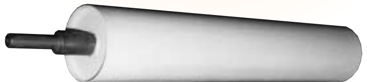
One of the smallest Magnetic Pulleys in the range - 215mm diameter